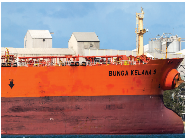
Damien O'Mara, Bunga Kelana 8 (detail) 2019, inkjet print on photorag.