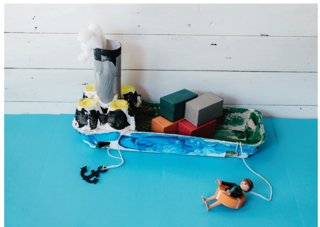
Cargo Ship painted by Finn.

Redland Art Gallery Tel: (07) 3829 8899 or email: gallery@redland.qld.gov.au artgallery.redland.qld.gov.au