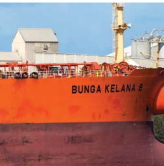
Image: Damien O'Mara, Bunga Kelana 8 (detail) 2019, inkjet print on photorag.