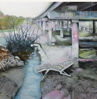
Image: Dennis McCart, Some kind of nature (detail) 2019, oil on linen on hardboard.

The Port series by Damien O'Mara presents several large, industrial landscape photographs of the Port of Brisbane. The images are shot with a consistent method and composition, in reference to the objective methodology used by late-modern, industrial photographers like Lewis Baltz, Bernd and Hilla Becher and Andreas Gursky. O'Mara's exhibition challenges this aesthetic through a unique combination of objective method and abstraction. While the images display symmetry and grid-like composition, they also contain conflicting elements such as vivid, digital colour and abstracted form.