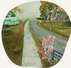
Image: Catherine Parker, Ocean narratives 2018, synthetic polymer paint on marine ply. Courtesy of the artist.