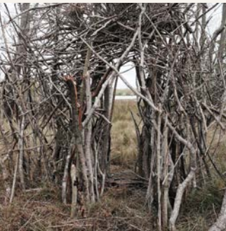
Image: Sandy Ward, Untitled (detail) 2018, Melomy's Wetlands, Canaipa Island.

An exhibition held in conjunction with Remembrance Day 2020.