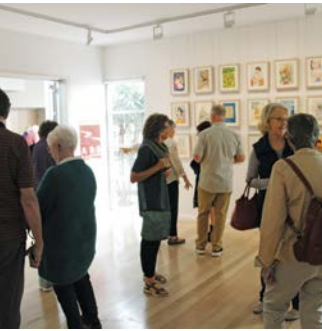
Image: In Focus 2019 at Redland Art Gallery, Capalaba.