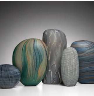
Image: Clare Belfrage, A Measure of Time , collection of works (detail) 2018, tallest height 530mm.