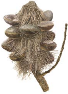
Image: Anne Hayes, Banksia serrata , old man banksia, gabiirr (Guugu Yimithirr), 2017. Watercolour on paper, 63 x 45 cm.